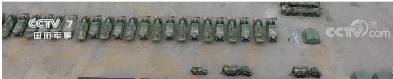
Figure 5: Elements of a PCH191 battalion in the 71st Artillery Brigade, including 12 launchers, at least 11 loading vehicles, two ammunition support vehicles, two command vehicles on a MV3 chassis, and at least one battery command vehicle on a Mengshi chassis. 35

The basic PCH191 combat unit is a battery of four to six launchers, an equal number of ammunitions reload vehicles, and a command vehicle that uses high-mobility Mengshi chassis. 36