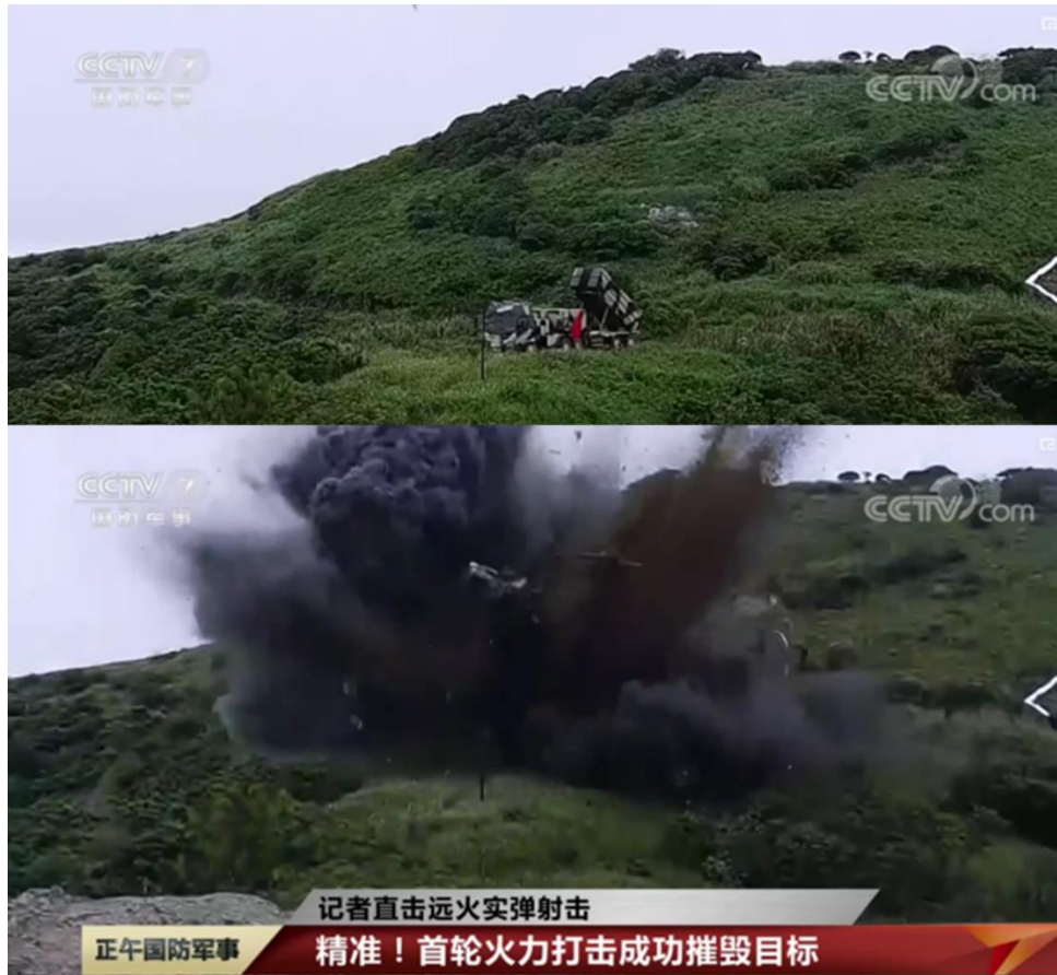
Figure 9: 71st Artillery Brigade using a PHL03 MRL to fire at a mock Patriot air defense battery using Taiwan military paint camouflage in June 2021. 55

The PLAA has trained against several of these targets, both through simulation and live fires, but primarily with the older PHL03. For example, the 71st Group Army Artillery Brigade, ETC, used its PHL03 to strike a Patriot missile battery and unidentified jet aircraft mockups. 53 The PCH191, in contrast, has not been regularly observed firing at specific Taiwan-related targets. Rather, the PLA continues to use the newer MRL to demonstrate capability in the Taiwan Strait during large-scale training events and response actions. 54