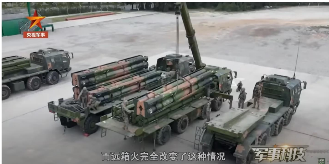
Figure 6: A loading vehicle of the 73rd Artillery Brigade takes modules from an ammunition support vehicle and loads them on to a PCH191 launcher in May 2023. 37

The basic PCH191 combat unit is a battery of four to six launchers, an equal number of ammunitions reload vehicles, and a command vehicle that uses high-mobility Mengshi chassis. 36