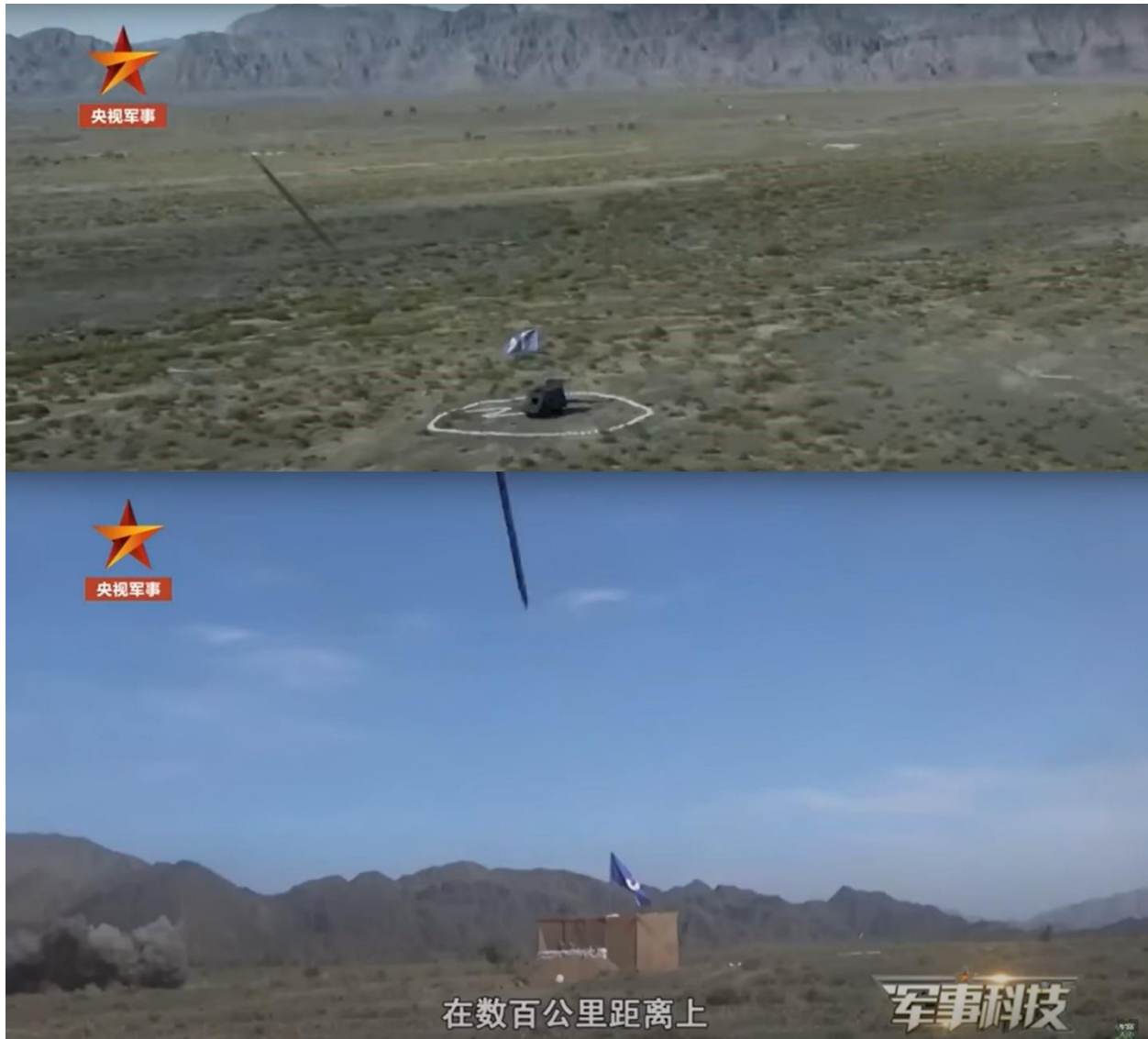
Figure 10: PLAA 73rd Artillery Brigade using PCH191 MRLs to fire on tactical targets like those that would be struck during the island landing phase of a Taiwan campaign. 58

One of the benefits of the PCH191 to landing forces, specifically the Army units coming ashore in amphibious armored vehicles and landing in the rear via heliborne transport, is that the MRL systems are directly tied to group army command networks. This means that Army maneuver units should be able to share their own battlefield data with group army functional support units, like artillery brigades, to speed up fire support. According to a September 2022 article in the North China Vehicle Research Institute's Tank and Armored Vehicle magazine, the system's fire response time is faster than that of PLAAF aircraft and has an accuracy level like that of the DF-15 and DF-16 SRBMs. 59 Additionally, the use of MRLs to strike at defensive targets in a combat zone spares PLAA helicopters and PLAAF ground attack platforms from having to execute close air support missions where air defense systems may remain active.