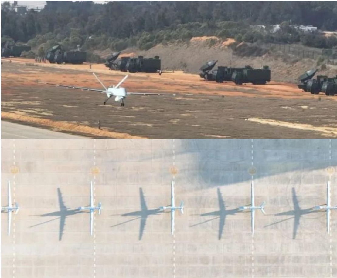
Figure 11: Photos of the Eastern Theater Command Army Intelligence and Reconnaissance Brigade CH-4 UAS platforms. 66

to PLA media from January 2023, a battalion in a certain Eastern Theater Army brigade, almost certainly the Intelligence and Reconnaissance Brigade, now fielded the CH-4 UAS. 64 Each theater Army has an Intelligence and Reconnaissance Brigade that includes airborne ISR and ground reconnaissance teams to provide the commander with a multi-dimensional reconnaissance network. 65 The ETC Army Intelligence and Reconnaissance Brigade's acquisition of the CH-4 enables the PLAA to maintain its own airborne ISR over Taiwan to help direct and correct fires without sole reliance on its sister services.