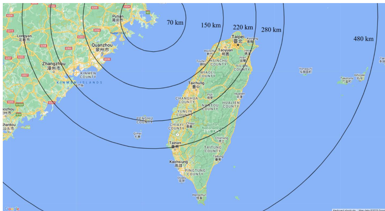
Figure 4: Ranges of PCH191 munitions when fired from Pingtan Island, Fujian province.

(NDU) and former Director of the NDU’s Strategic Research Institute, emphasized the ability of the long-range rockets to “cover the entire island” (远程火箭炮都可以覆盖全岛). 23