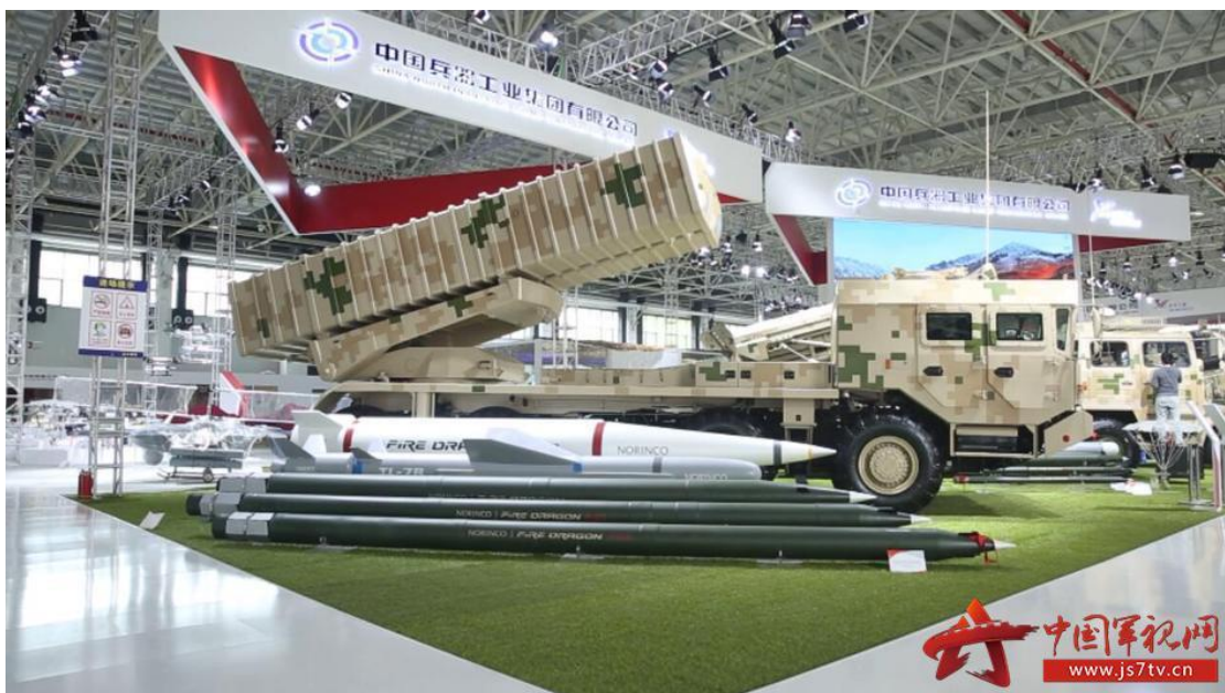
Figure 3: NORINCO's display of the AR3 MRL and its munitions at the 2018 China International Aviation and Aerospace Exhibition at Zhuhai. 19

The munitions designed for use with the PCH191 and its export variant, the AR3, encompass a mix of guided and unguided rockets, in addition to a tactical missile and an anti-ship missile. With its modular pod design, the PCH191 can load two pods with different size ammunition types to enable it to strike multiple targets in one volley. A July 2022 article by a professor at the PLAA Artillery and Air Defense Academy states that the unguided rockets are optimal for saturation attacks, while the rockets with satellite navigation or inertial navigation systems allow the PCH191 to strike targets traditionally reserved for missile units, but at much lower costs due to not having a need for advanced control systems, larger warheads, anti-jamming assets, and detection-reducing capabilities. 18