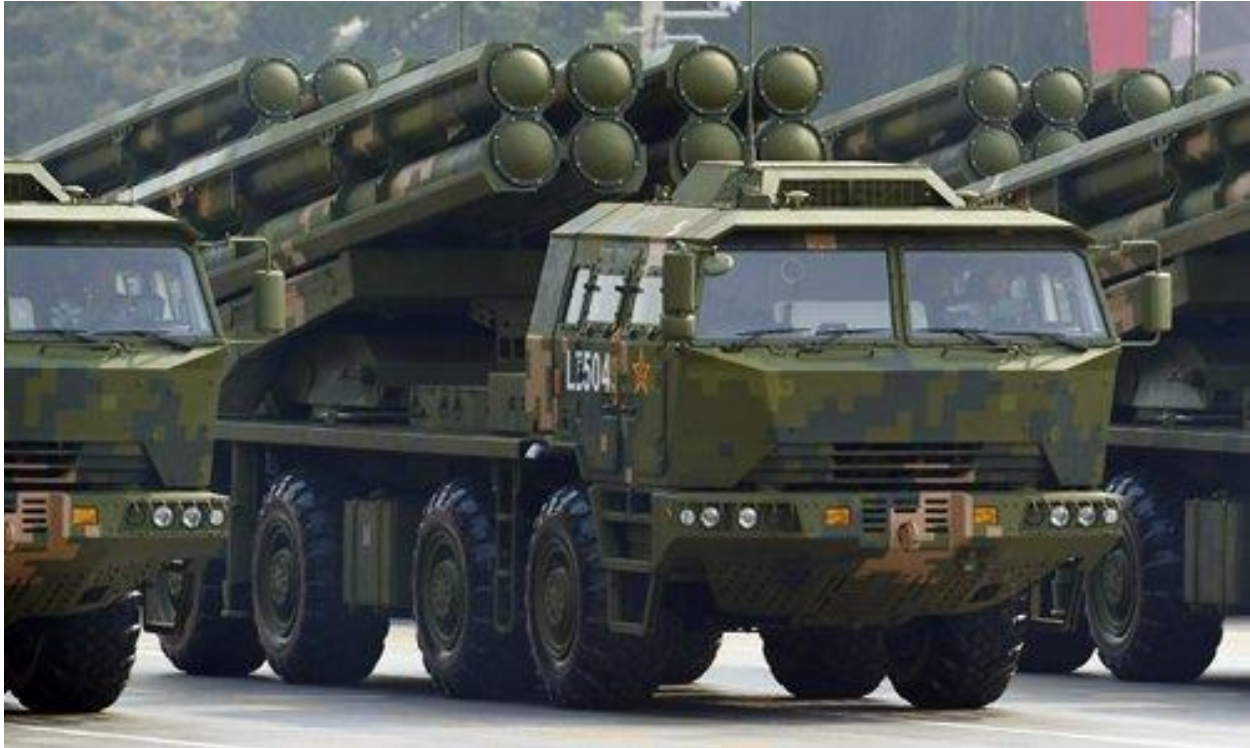
Figure 2: The PCH191 modular long-range rocket launcher makes its debut at the Chinese National Day Parade on October 1, 2019. 13