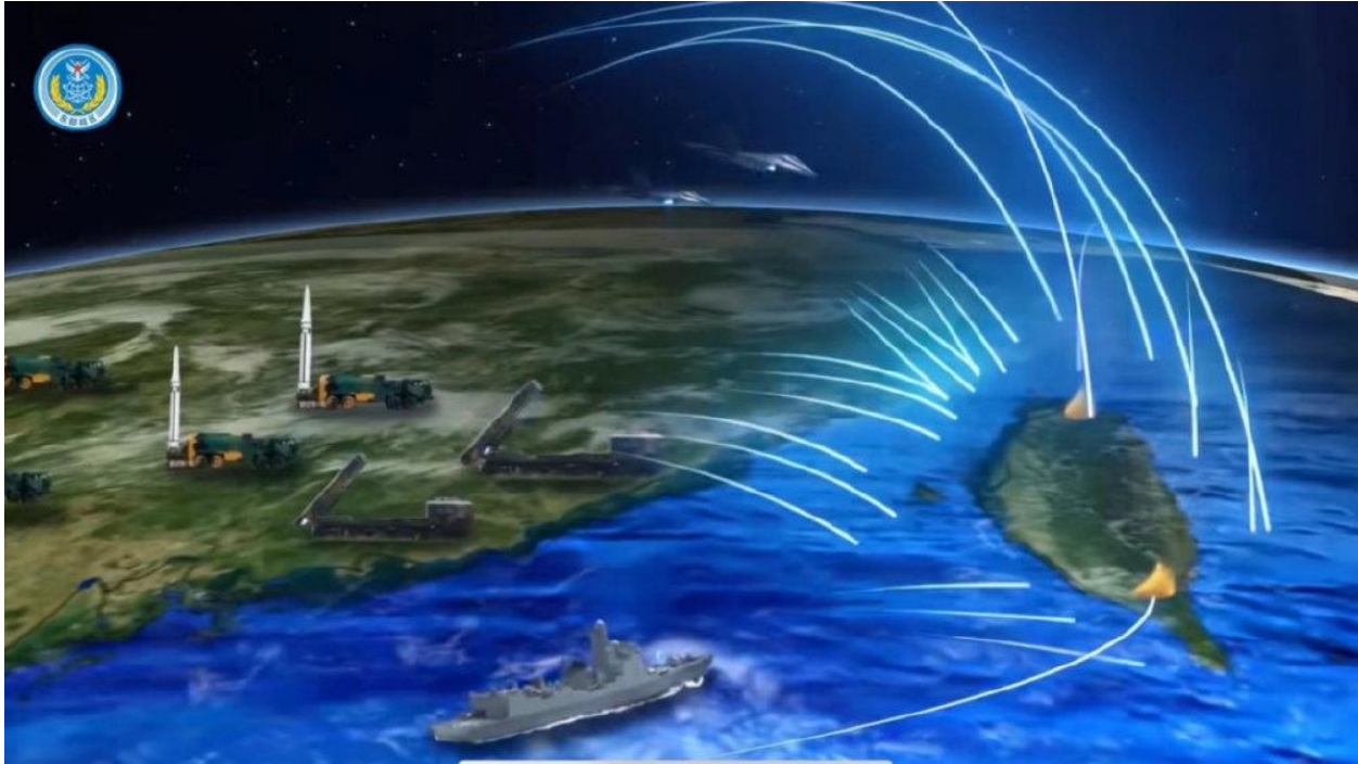
Figure 7: A snapshot from an animation on the PLA ETC official WeChat site during the April 2023 “Joint Sword” exercise. The animation illustrated roles for joint firepower platforms as part of a Taiwan campaign. 42