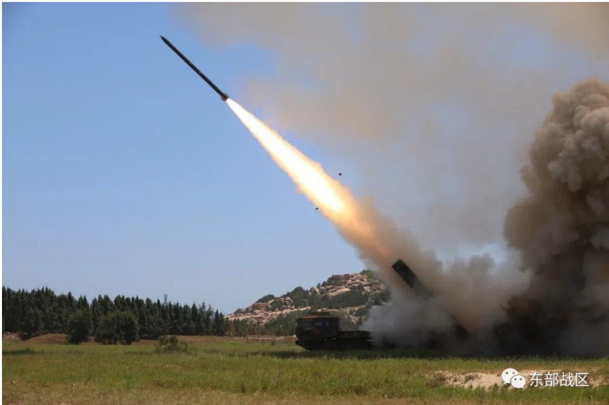
Figure 1: A PCH191 long-range MRL fires rockets as part of the August 4, 2022 joint response action to U.S. House Speaker Nancy Pelosi's visit to Taiwan. 3

Yet the introduction of the PCH191 should not be overlooked. 2 It marks a major advance in the PLAA's potential contributions to a cross-strait invasion. While the Army traditionally had the lead in landing on the island and seizing key strategic points during a potential Taiwan invasion campaign, China's primary ground force only had limited capabilities to affect the battlefield prior to landing. Once on the island, its armor and infantry forces would have to rely heavily on the joint services to protect their troops on the beaches and in-depth because it lacked the organic weapons to execute those fire support missions. The range and precision of the PCH191 now allows the PLAA to quickly execute these missions out to ranges nearing 500 km. Moreover, it can provide those same capabilities to assist its sister services by striking air and coastal defense missile systems, sea surface targets, and air and naval bases in Taiwan. With the continued fielding of the PCH191, the Army is moving from simply the main ground force in a Taiwan campaign to potentially the primary contributor of tactical fires on the island.